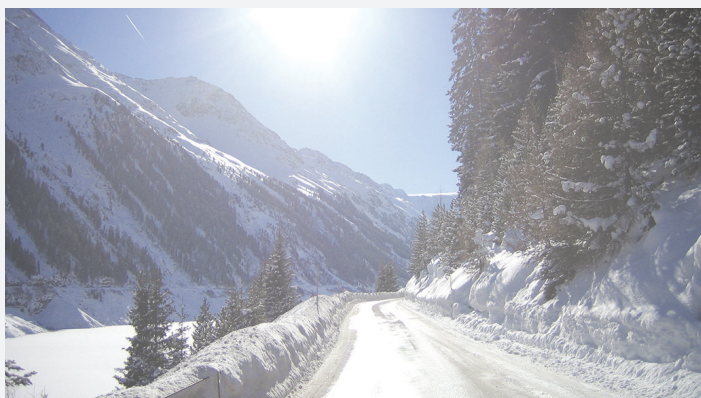
Without Polarized Lens

Harmful Solar Blue Light filtered out while non-harmful light passes through, allowing good color perception.