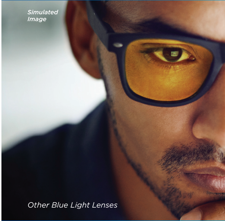
Other Blue Light Lenses