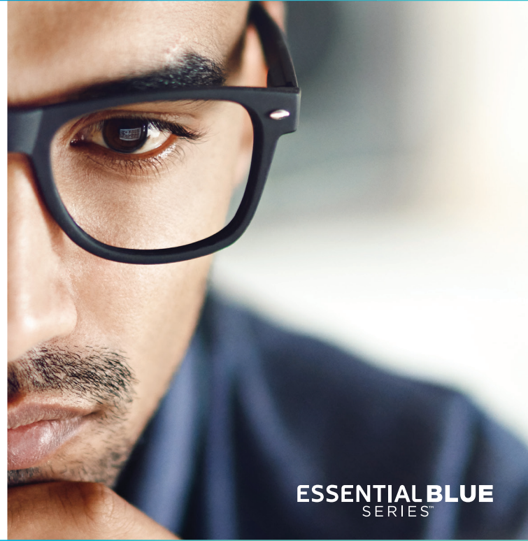
ESSENTIAL BLUE SERIES™