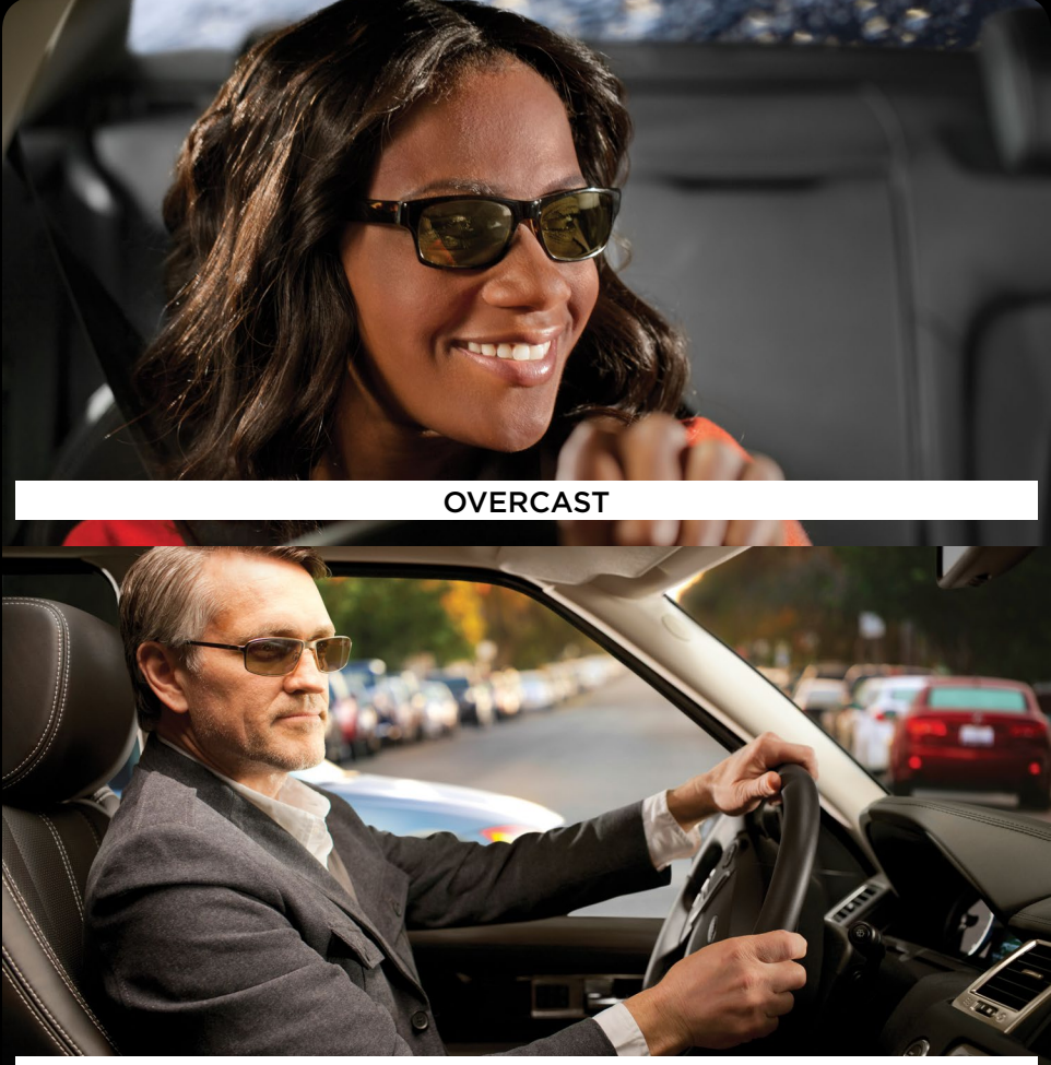
BEHIND THE WINDSHIELD: SUNNY