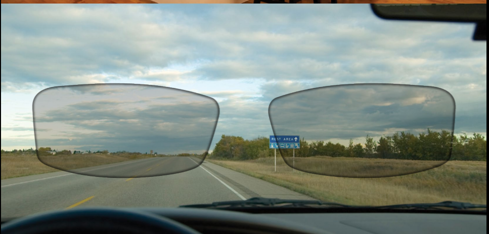
OUTDOORS: MID-LIGHT OR BEHIND THE WINDSHIELD