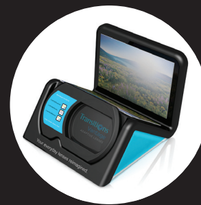
1 – Glare simulator

*You may purchase the UV demo lamp through Transitions Optical customer service at 1-800-848-1506.