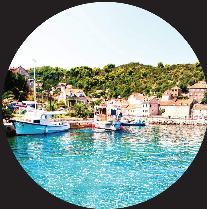
Ordinary clear lenses