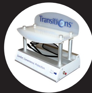
1 – Transitions lens UV demo lamp*