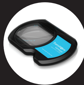
1 – Transitions Vantage lens in lorgnette holder