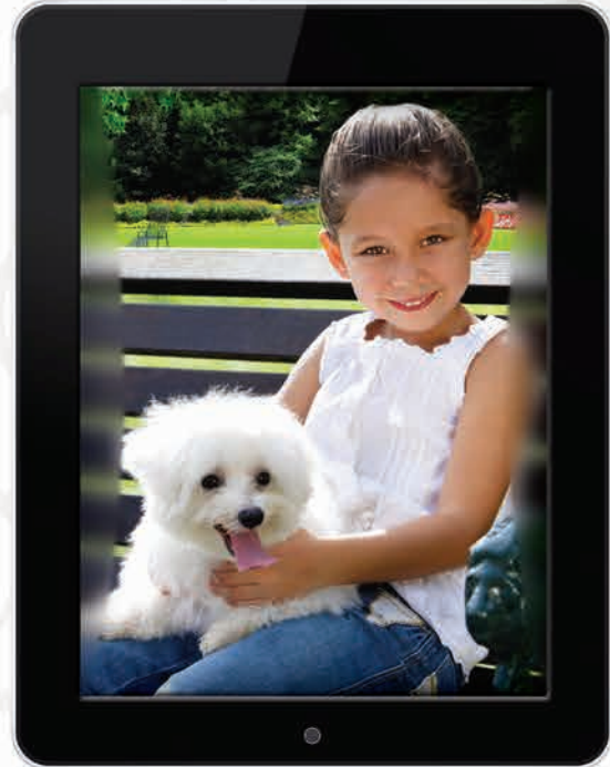
With lens personalization, patients experience optimal vision.