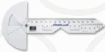
Varilux® Fit Tool