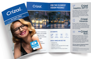
1 Consumer Brochure