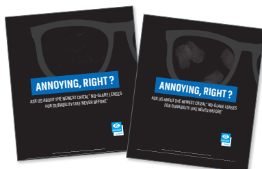
2 Window Clings